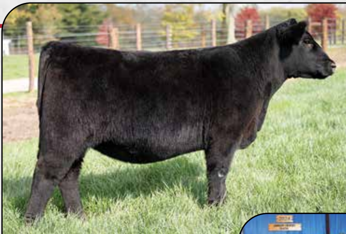
Full sib to Lot 43 Shown by the Lanum Family

The Maines are hotter than they ever been & with limited semen production the TJSC End Games are even more rare. Her 3 full sibs have averaged over 10K & Rylie Lanums was Reserve AOB at the 2024 Hoosier Beef Congress. A full sib bull was sold at the top of 2024 OBE Sale.