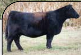
104 C (Walks Alone Donor) Dam of Lot 16