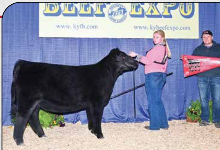
Full sister to Lot 55