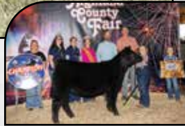
Lainey: Maternal sister to Lot 59, Dam of Lot 57 is also a maternal sister