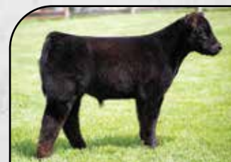
HIA x 444