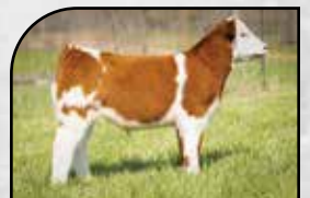
HGTA x Lot 1