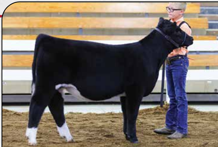
Lot 54 as a calf