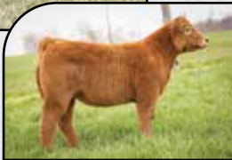
IGWT x Spice