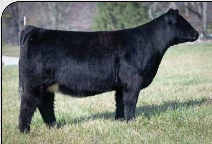
TPSC Flashy Lady 360K - Dam of Lot 10