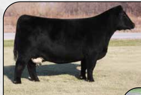
JSC Katie 5S Dam of Lot 1

MINN Look At Me 932G is a daughter of the famed JSC Katie 5S that has produced multiple national champions and highly sought after females. This powerhouse female has all the big parts and pieces needed to make next level cattle. A royally bred female that can play ball in many fields. She is a dual registered 3/8 MaineTainer and 1/2 Simmental in a TRIPLE clean package. She has worked well for us to several different matings whether it be clubby or breeding cattle. 932G has been flushed one-time conventionally yielding 15 eggs. Take note that she is bred to the King of the Ring Here I Am and due early January. This is a proven mating that has huge generating potential and return on investment. Here is an opportunity to own a big-time donor that can and will deliver. We have eggs in the tank are excited to share her genetics with you. Check her blaze face Daddy's Money daughter selling as Lot 2.