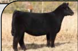
1Oak x Lot 13