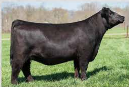
Flush Opportunity Sells