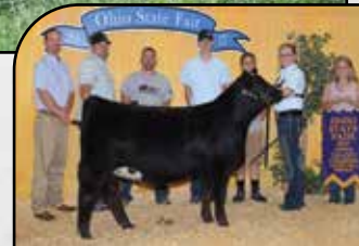
Lot 66 as a show heifer