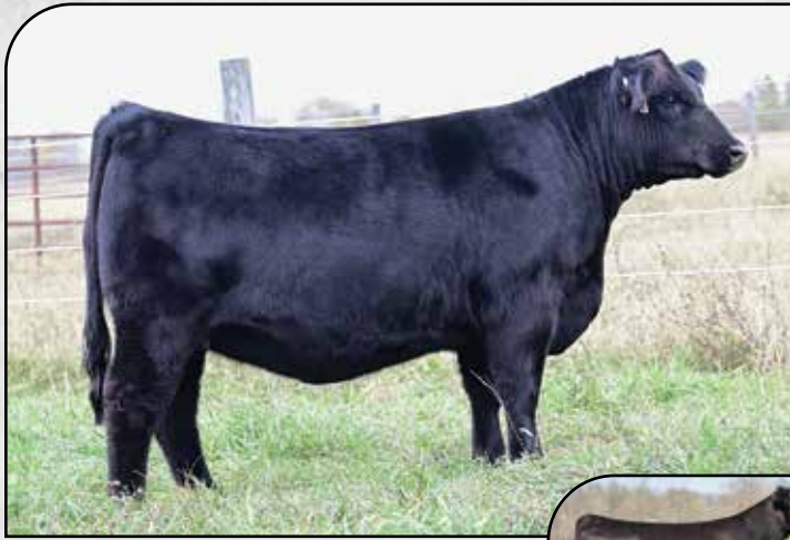
BNWZ Queen 7477 Dam of Lot 51