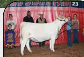
Froggy - Dam of Lot 67