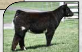
HIA x Lot 1