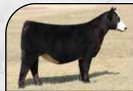
Spot On x Lot 60