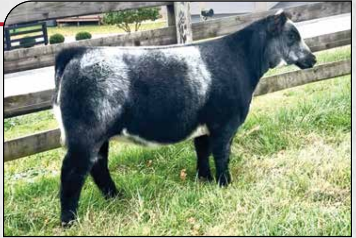
2025 Calf of Lot 36

Broody black brockle-faced Plus cow that raised a cool blue heifer(pic) by the same current service sire. He is a powerful purebred (Perfection x Asset) raised by Farrer. This cow's males can always be Plus' and mated as she currently is her heifer calves too! She's clean by pedigree so be the winner and make big plans.