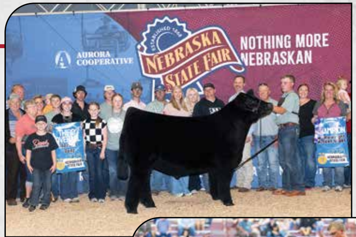
Third Overall Nebraska State Fair - Full sib to Embryos