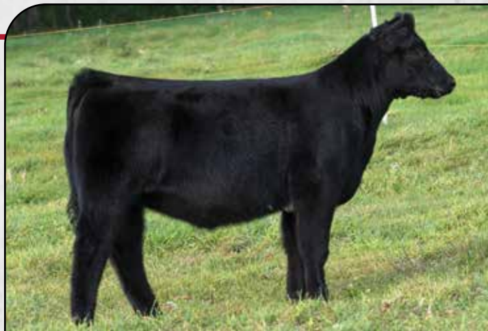
Lot 28 pictured as a calf