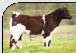
HIA x Lot 60