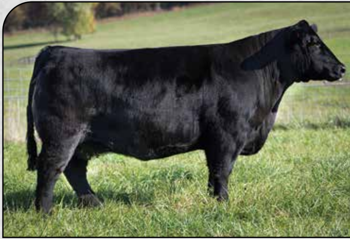
GCC Dixie Erica F438 - Dam of Lot 8