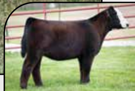
Investment x Lot 12