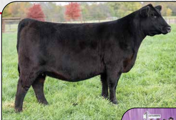
Full sib to Lot 42

Daughter of the 2021 Record setting Simmental sire that sold for $530,000, SO Remedy 7F. Full Sib to our newest donor, CampbellCo Remy that was Reserve Sim Angus at the 2024 Cattlemans Congress & 2024 National Western Stock Show. Semen alone is commanding over $1000 a unit, don't miss out on these elite genetics. Bred safe to sexed female semen to the new hot sire, WHF Point Proven.