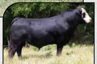
Merlin 2.0: Service sire of Lot 74