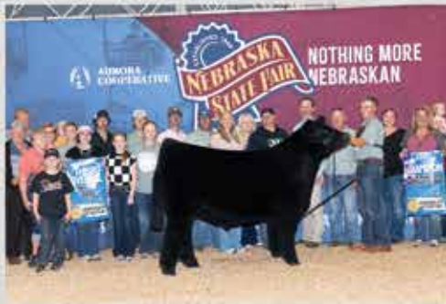
Full Sib Embryos Sell