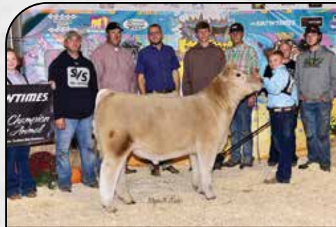
Full sibs to embryos selling