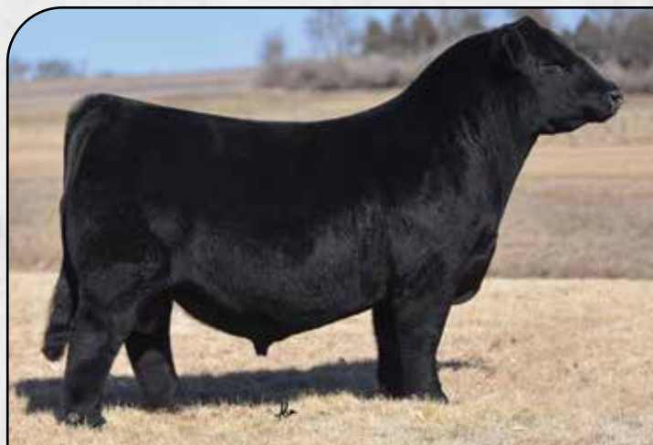
ROSE Apex 3204L - Sire of Embryos

SCAT Who Dat Red Rattler ET flushes well, so we can continue to share the love! Selling sexed female embryos out of the super-hot Apex. Last year, when we sold the Primo eggs, we hadn't had any offspring-this year we can tell you this cow works! My daughter has decided to keep the one and only heifer we have raised to date as a part of her show string and plans to take her to Grand Island next summer as her Bred and Owned entry. If this mating doesn't make you excited-check your pulse! Guaranteed 1 pregnancy if transferred by certified embryologist and completed during 2026.