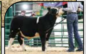
Son of Lot 52