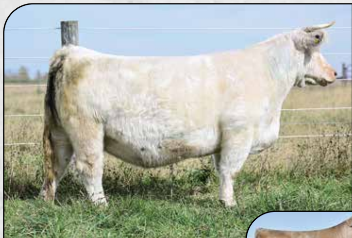
Chad Thompson Donor Dam of Lot 49