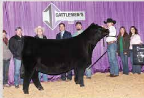
Full Sib Sells as Lot 42