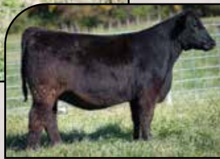
Dam of Lot 65