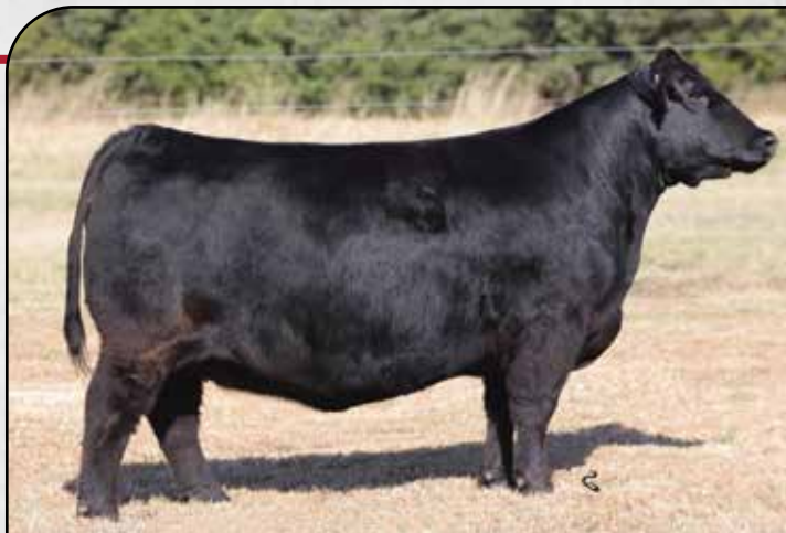
Miss Boston - Full sister to Dam of Lot 53

Yes, you read this pedigree correctly!! Sammy is out of a full sister to the infamous Miss BOSTON, who accomplished so much in her lifetime for the Griswold program, who stems from one of the most influential females to ever walk the pastures of the G-, GCC Miss Whiskey 5066! Driven 80, Miss Boston, Miss Whiskey 5066, AI'd to Safety First, if your serious about Maine-Anjou genetics you better own Sammy 5066 ET!