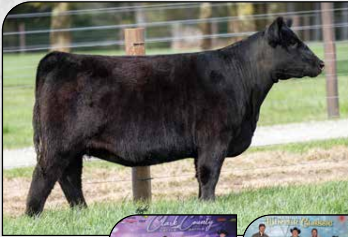
Full sibs to Lot 45