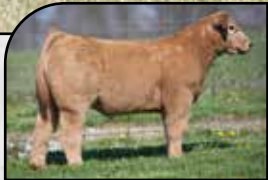
IGWT x Spice