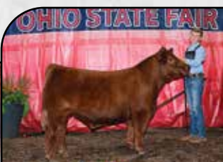
HGTA x 444