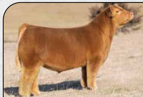
Lot 60 Service Sire: Paved With Gold