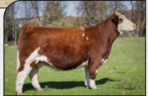
MINN Look At Me 932G ET Dam of Lot 2