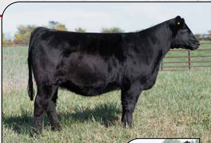
Agle WhoDaLady Duff ET Dam of Lot 22 & Lot 23

I've been bringing breds to this sale since it started and this is the most exciting female I've ever consigned. She's a high chi and 3/8 Maine and her structure and build are impeccable. This female is out of the WhoDaMan Duff Lady 031 cow that I've been IVF'ing on pretty hard the last couple of years. Her grand dam is the Duff Lady cow that topped Duff's 2014 sale at $45,000. If you need a donor to make some females out of you can't go wrong with this one. Incredible breeding piece with endless breeding possibilities.