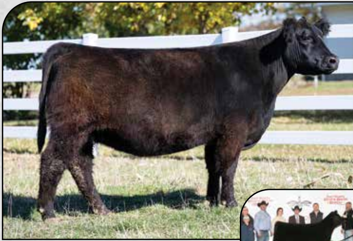
Full sib to Lot 39