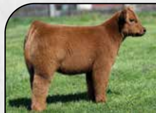
HGTA x 444