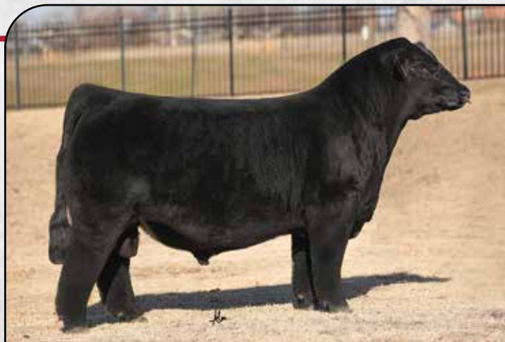
K&A Jester - Service sire of Lot 31

The breeders said I bought their best momma cow prospect as a calf. I loved her then, love her more now! Real Power in all aspects of bone, width, internal dimension and muscle yet feminine and smoothly constructed. 1/2 blood Maintainer on the way!