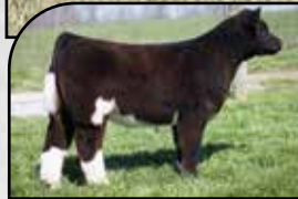
HIA x Spice