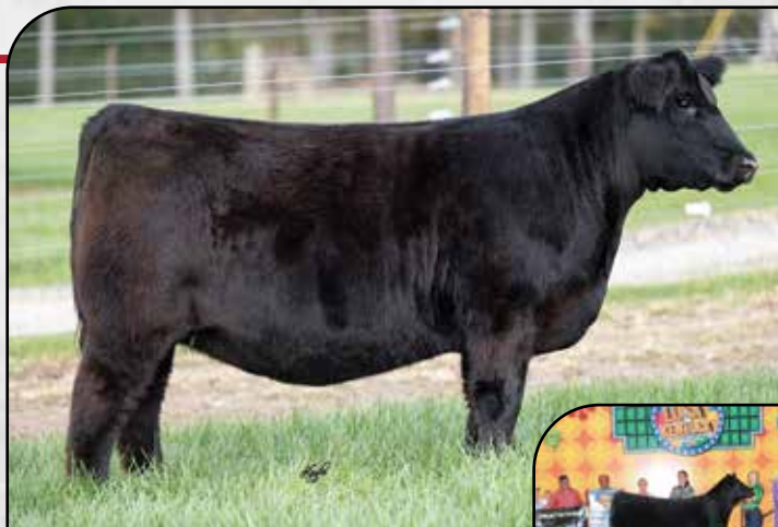
Maternal sib to Lot 44 Reserve Maine Angus at Jr Nationals