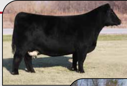
JSC Katie 5S Grand Dam of Lot 2

A high quality ET daughter of MINN Look At ME 932G and the great Daddy's Money. Attractive looking female that excites us from both a quality and genetic standpoint. A cool blaze face heifer that is backed by some of the best cattle in the business. She has the good looks of her mother that will fit in the top of any program. Her build is incredible with a super cool look. The Data Bank calf in her belly will be high quality and very marketable.